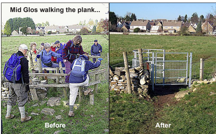
Mid Glos walking the plank...