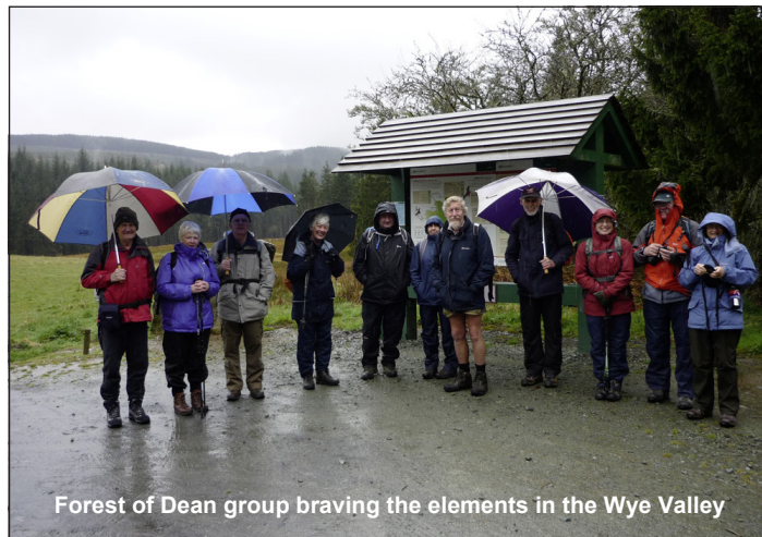
Forest of Dean group braving the elements in the Wye Valley

GLOUCESTER GROUP: We continue to have a short mid-week and a full-day weekend walk almost every week, and more recently a monthly short weekend walk has also been introduced. We are very grateful to the many leaders that volunteer to support this programme. With the longer evenings we have been able to stretch our legs further from home and we enjoyed a coach trip to the Cheddar Gorge with an interesting and dry walk, and as a 'reward', our first cream tea of the year!