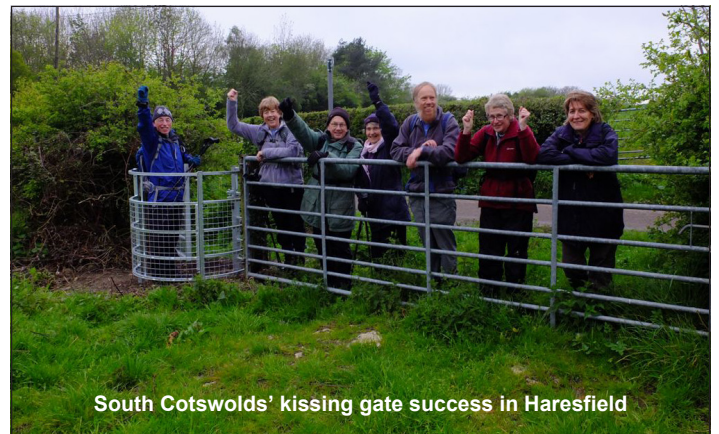
South Cotswolds' kissing gate success in Haresfield

SOUTH COTSWOLD: Our walks programme continues to grow with 57 walks in the period March to June 2012, with 61 scheduled for July to October. Attendances are still buoyant, often exceeding 30. Our Monday 'Start the Week Walks' are proving popular, attracting many walkers who find our normal programme a little daunting at present, as well as regular members who like the idea of a leisurely stroll with a pub stop to finish. They have included a walk from Cricklade to see the fritillaries. Our Gloucestershire Way walks continue for those looking for something a bit more challenging and we have now reached Minsterworth.