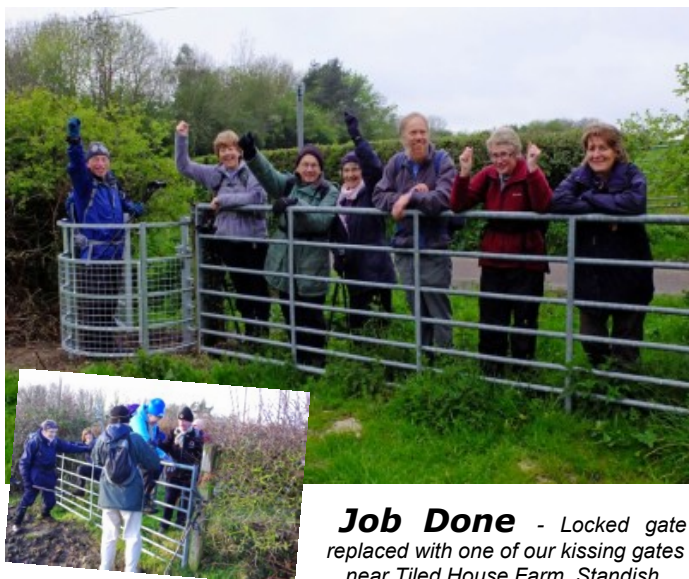
Job Done - Locked gate replaced with one of our kissing gates near Tiled House Farm, Standish.