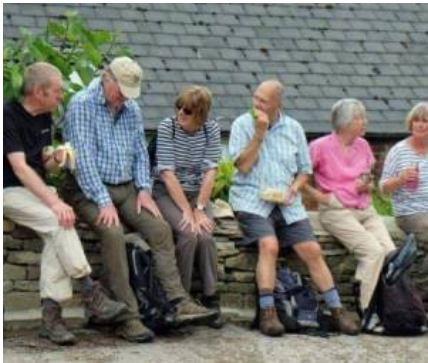
Sitting on walls having coffee

If you want to meet people and make friends, you might think of taking up a team sport like football or hockey, but these pictures show that there is a fair bit of chatting going on during South Cots walks!