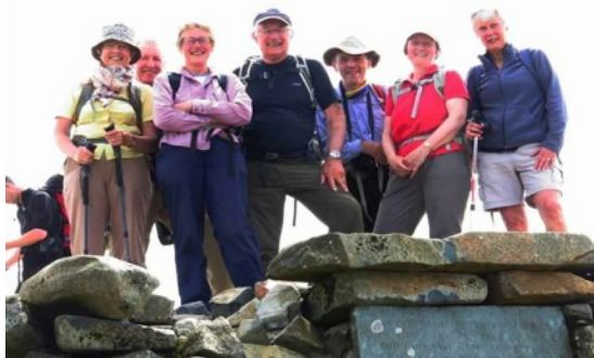
Conquerors of Scafell Pike

We have had two group holidays, one in the Lake District and one on Exmoor both of which were well supported and next year plans are in place to go to Lulworth Cove and back to Dunster.