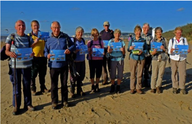
Members proudly displaying their certificates on Uphill beach on 4 October 2014