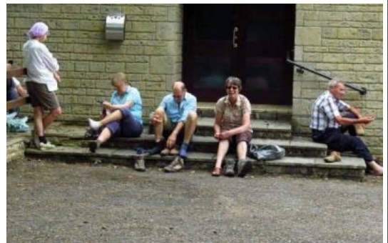
Removing boots at the end of a walk