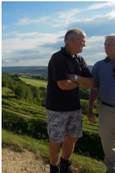
Serious man's stuff