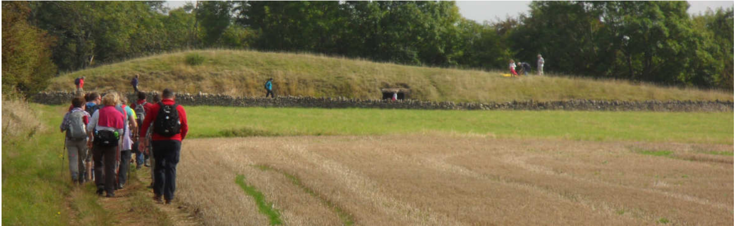
Cirencester Group at Belas Knap