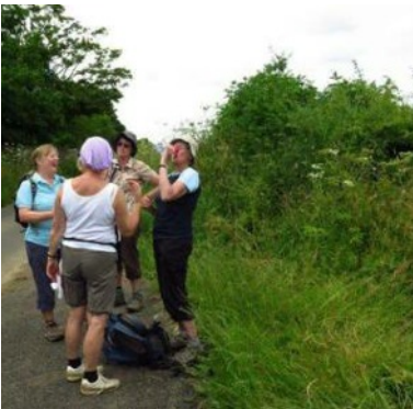
By the roadside