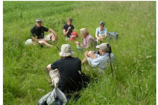
In a field having lunch