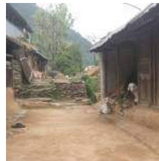
The village before the earthquake